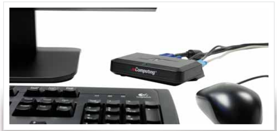
The X350 and the X550 are ideal for business, government, public access, classrooms, and computer labs.

Up to eleven users on one PC? Absolutely—today's PCs are so powerful that the vast majority of people use only a small fraction of their available computing power. The X-series taps the unused capacity so that up to eleven users can simultaneously share a single PC. Each user gets their own virtual workspace (applications, settings, files, and preferences), but at a fraction of what it would cost with individual computers. So even though eleven people share a single system, they each get their own rich PC experience.