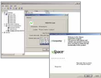
vSpace™ virtualization software